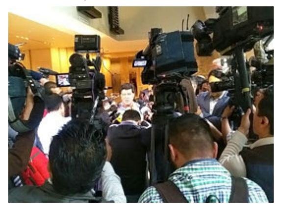
In light of the federal government throwing a lifeline to civic journalism, take a quiz about perception of media bias.