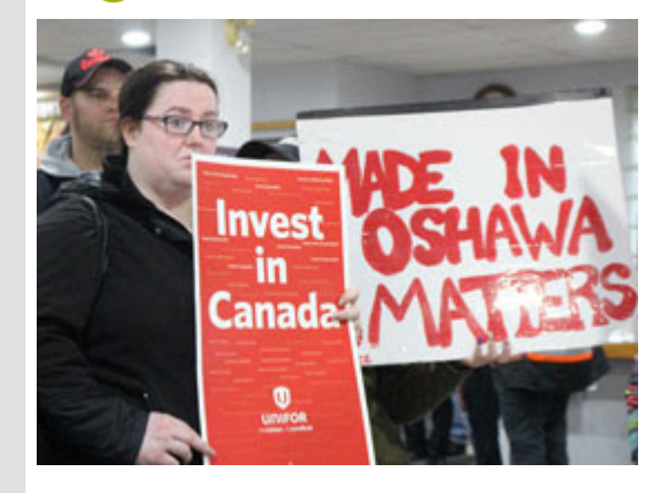
Unifor calls on GM to live up to the spirit of the agreement made during 2016 contract negotiations.