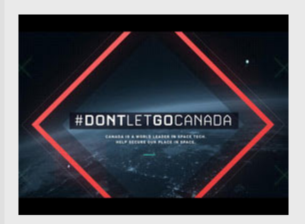
Unifor joins Don't Let Go Canada coalition, calling on the federal government to develop a long-term space strategy.